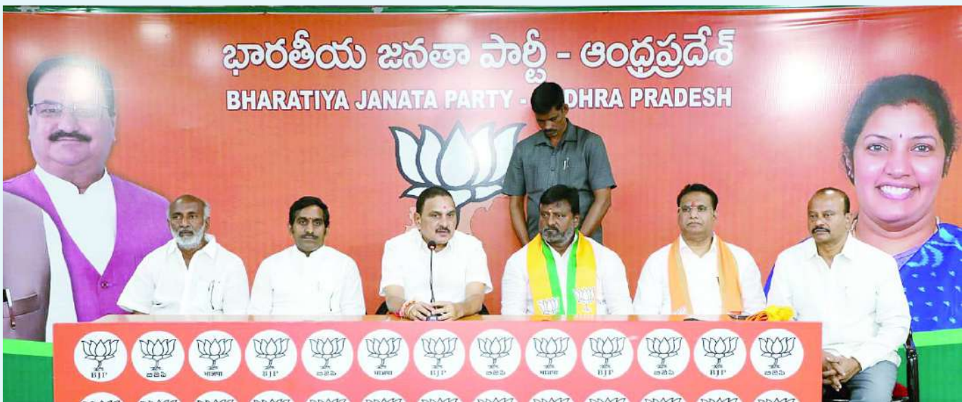
Union Minister Srinivasa Varma addressing the media at BJP party office on Monday along with party leaders