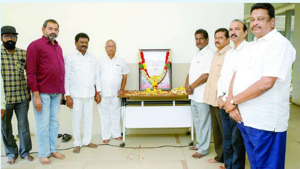
Senior TDP leaders paying tributes to former minister late Kodela Sivaprasda Rao at party central office on Monday