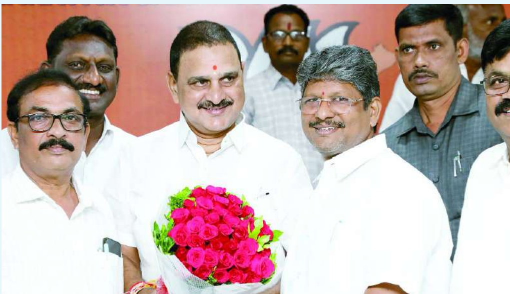
APJAC chairman Bopparaju Venkateswarlu felicitating Union Minister Srinivasa Varma