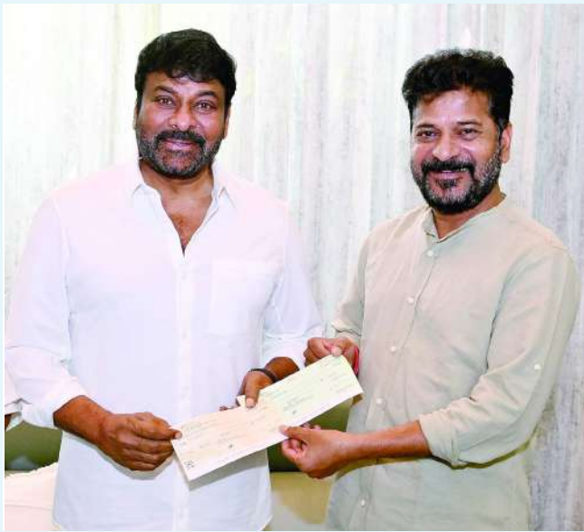
Actor Chiranjeevi donating Rs 50 lakh cheque to Telangana Chief Minister A Revanth Reddy on Monday