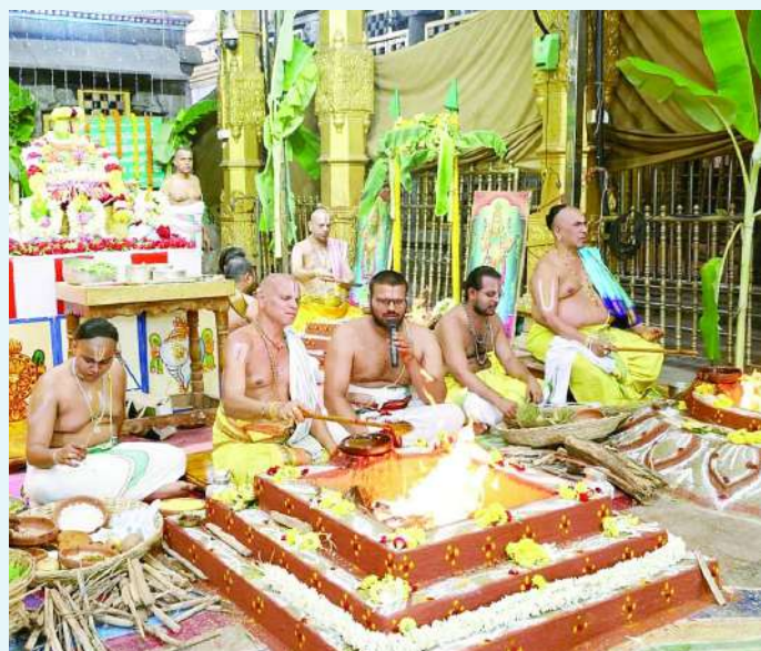
The priests participating special pujas as part of Padmavati pavitrosavalu on Monday