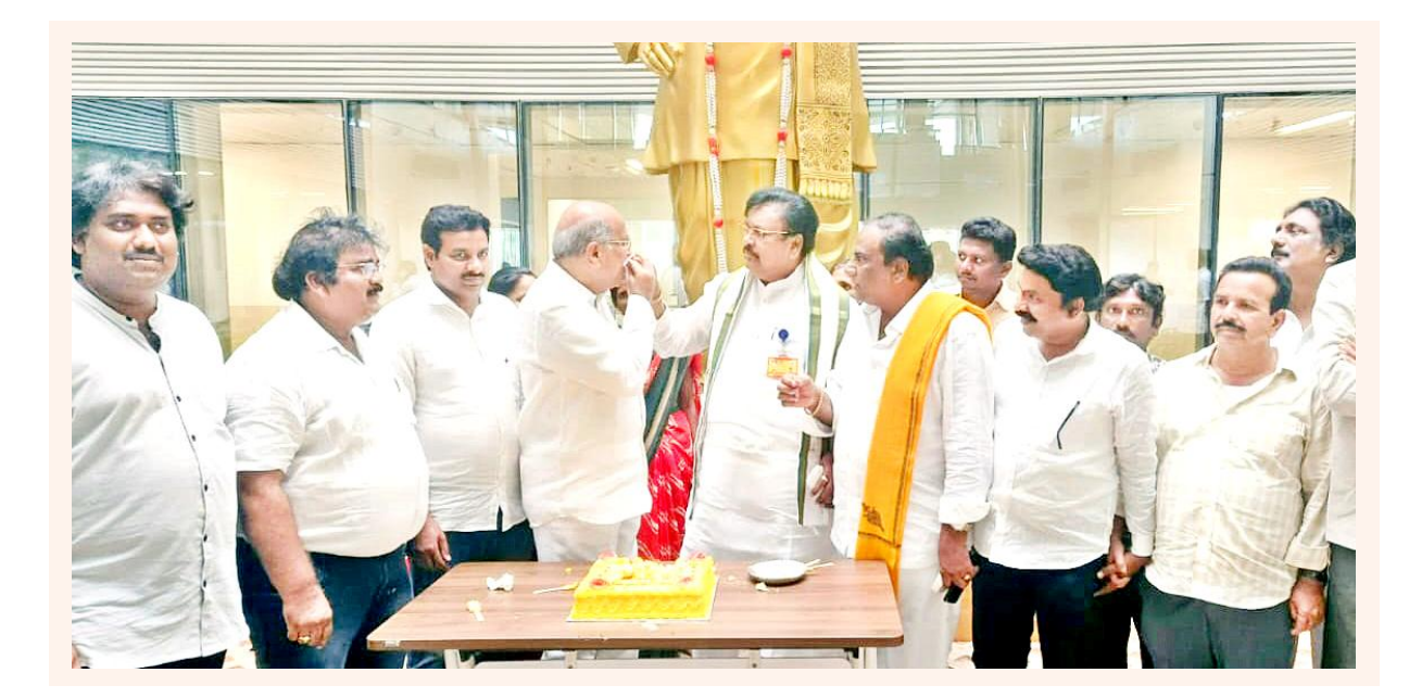
Balakrishna birthday celebrations at party central office on Monday