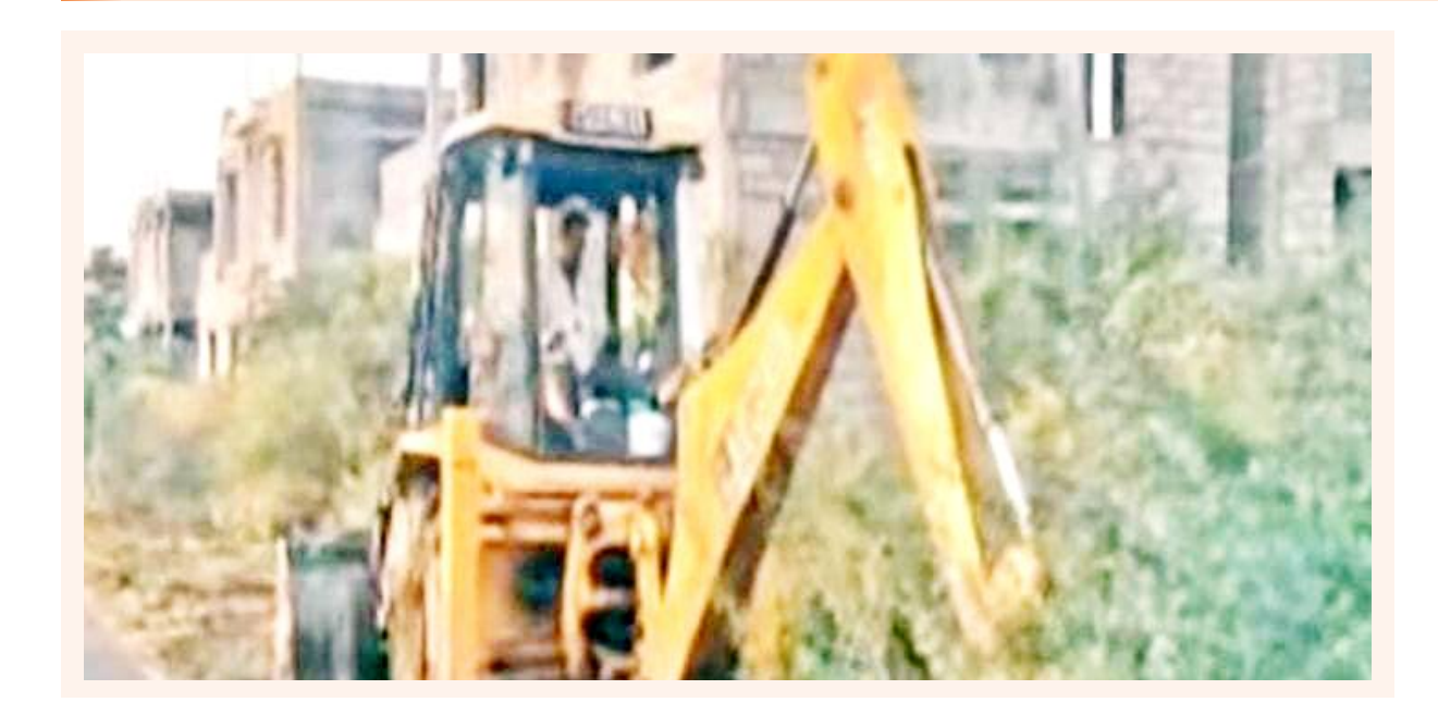
Jungle clearance works in Amaravati capital location on Monday