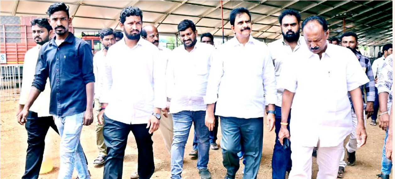
Former Minister Deviineni Uma and several TDP leaders inspecting arrangements for swearing in ceremony function