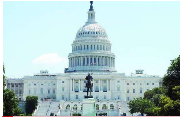
5 Raja Krishnamoorthi campaigns for Kamala Harris in Michigan