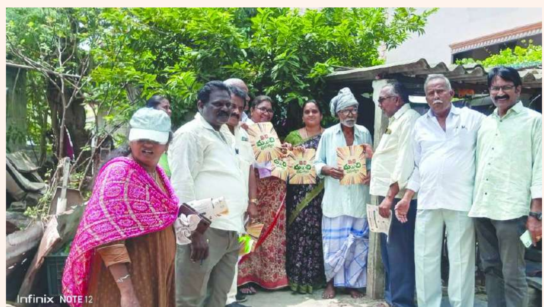
TDP leaders explaining to the public in G Konduru mandal in NTR district over its good governance in 100 days