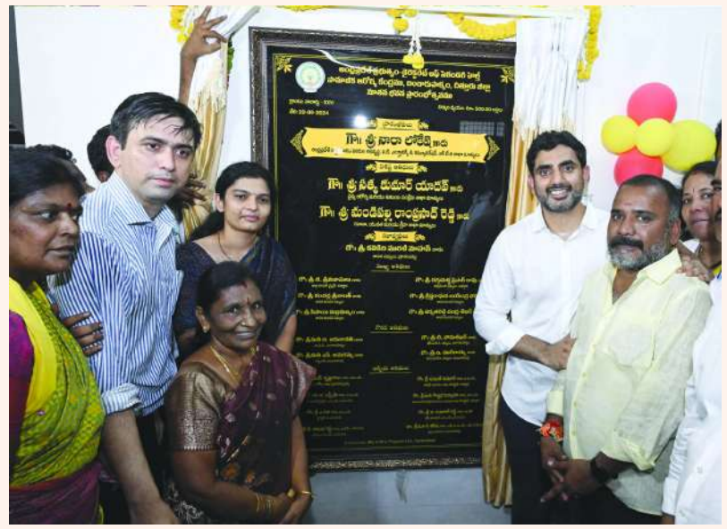
Minister for HRD Nara Lokesh inaugurating dialysis centre at Bangarupalyam in Chittoor district on Friday as part of fulfilling his first promise given during Yuvagalam paadayatra